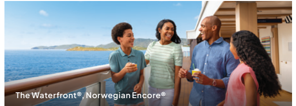
The Waterfront®, Norwegian Encore®

On select cruises. The cruises are marked accordingly in the reservation systems. You will also find an overview of cruises on ncl.com/more-at-sea . If there are 5–8 guests on a reservation, those guests will be required to pay regular fares.