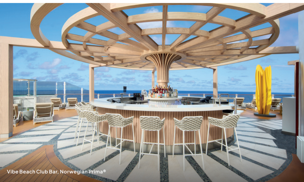
Vibe Beach Club Bar, Norwegian Prima®