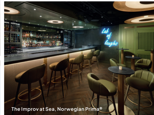
The Improv at Sea, Norwegian Prima®