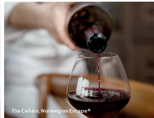
The Cellars, Norwegian Escape®