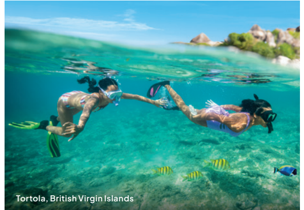
Tortola, British Virgin Islands

US$ 50 discount per stateroom and excursion. Discount is always credited to the first person in the stateroom. Also included are the ports of disembarkation. Discount will apply automatically to guest 1 in a reservation when shore excursions are booked via the agent booking engine, ncl.com or our call centre. Reservations need to be in BK status (confirmed) to book shore excursions. The US$ 50 discount will automatically be converted into local currency. Any shore excursions costing less than US$ 50 will receive 100% discount, reducing the price to zero. Rentals on Great Stirrup Cay/Harvest Caye are excluded. Embarkation ports are not included either. The discount is non-transferable and cannot be added up for use in individual ports. Can be used on multiple shore excursions in the same port.