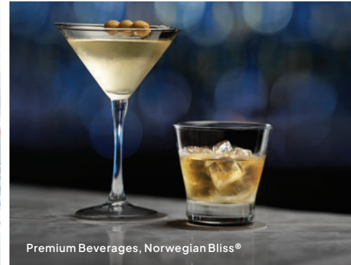
Premium Beverages, Norwegian Bliss®